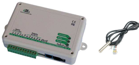
Internet controller and precision temperature probe